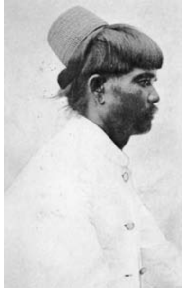
Fig. 15 (above left). “Evolution of a Bontoc Igorot constabulary soldier—1901, when he was a head-hunting savage” (Dean C. Worcester, The Philippines Past and Present [New York: Macmillan Publishing Co., 1914])