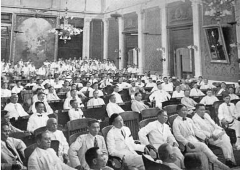
Fig. 20. Filipino elites in the colonial legislature, 1918 (U.S. Bureau of the Census, Census of the Philippine Islands, 1918 , 4 vols. [Manila: Bureau of Printing, 1920–1921])

not also submit to the force of a colonial reading practice that we might have wanted to expose and negate? And arriving at this moment of virtual complicity with colonial ways of seeing, as in fact nationalists tend to do, could the urge for a kind of violent separation not arise, fueled by the phantasms of humiliation and revenge, embarrassment and anger, critical smugness and moral superiority?