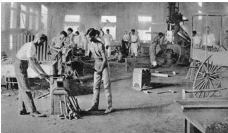
Fig. 19. “Typical scene in a trade school. In institutions like this, young Filipinos are being taught the dignity of labor and are learning useful trades” (U.S. Philippine Commission, Annual Report of the Philippine Commission, 1901–1908 [Washington, D.C.: U.S. Government Printing Office, 1902–1909])