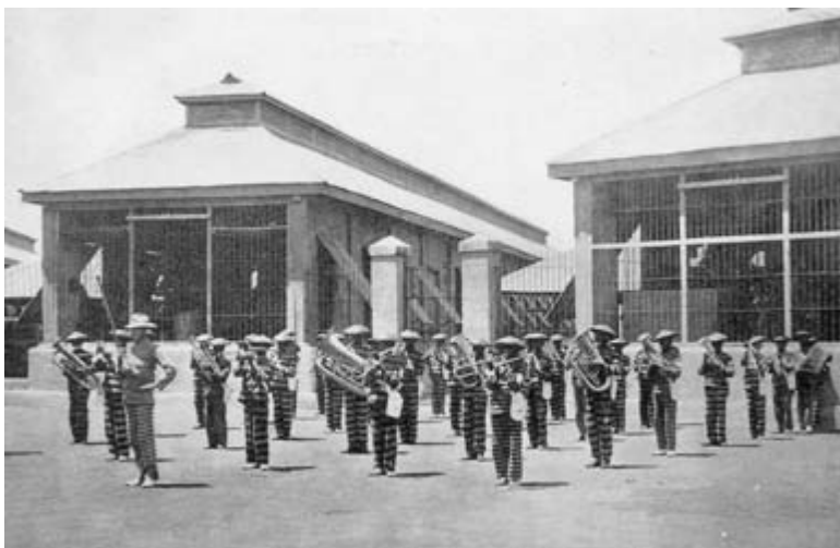
Fig. 18. “The prison band ‘sounding off’ at retreat, Bilibid Prison” (U.S. Philippine Commission, Annual Report of the Philippine Commission, 1901–1908 [Washington, D.C.: U.S. Government Printing Office, 1902–1909])