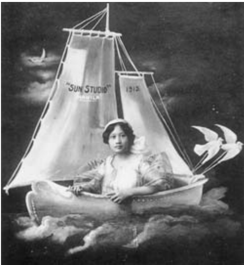
Fig. 26 (below). “Heartily dedicated to my dearest Enchang as a sign of everlasting friendship. Lovingly yours, Cleofe” (E. Aguilar Cruz, “Vintage Photographs,” in Being Filipino , ed. Gilda Cordero-Fernando [Quezon City: CGF Books, 1981])