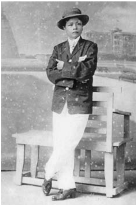
Fig. 28 (below): “To Chimang, To prove once more the sincerity of my true love. Otelio” (E. Aguilar Cruz, “Vintage Photographs,” in Being Filipino , ed. Gilda Cordero-Fernando [Quezon City: CGF Books, 1981])