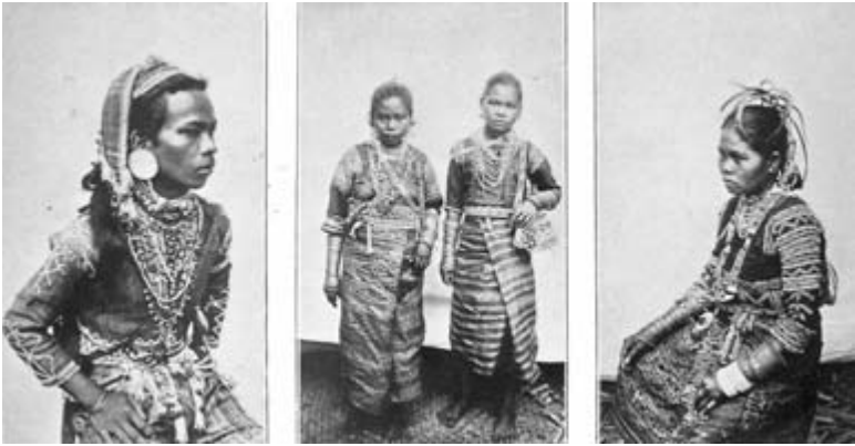
Fig. 10. “Bagobos, island of Mindanao” ( Annual Reports of the Philippine Commission, 1901–1908 [Washington, D.C.: U.S. Government Printing Office, 1902–1909])